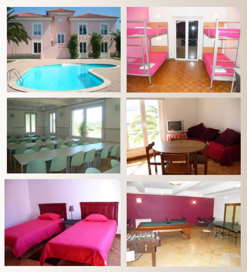
You can book the accommodations in this guide in JUST ONE STEP