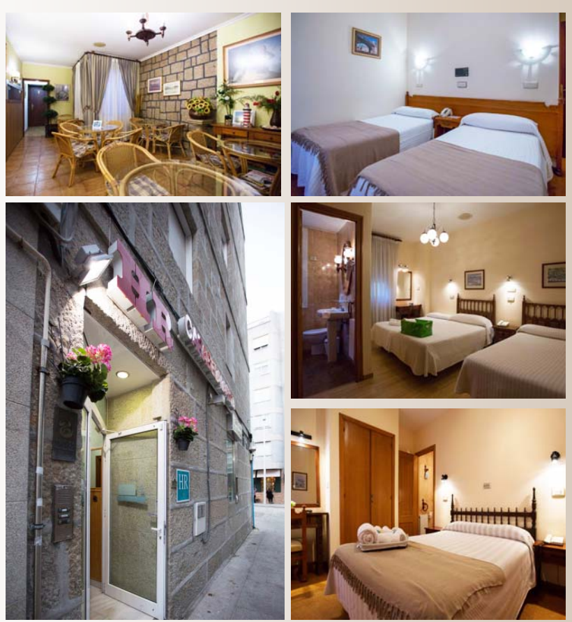
You can book the accommodations in this guide in JUST ONE STEP