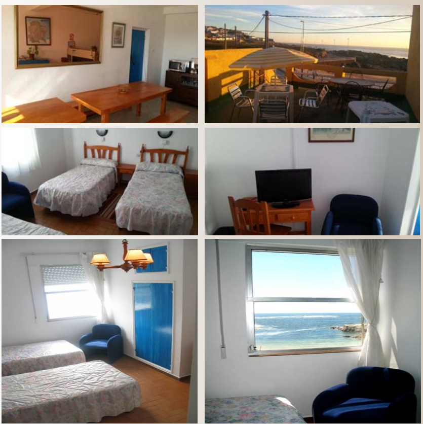
You can book the accommodations in this guide in JUST ONE STEP