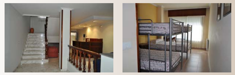
You can book the accommodations in this guide in JUST ONE STEP